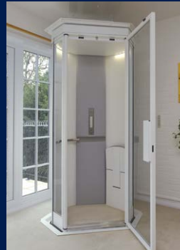
Lifestyle Home Lift

If you haven't previously considered a home lift, speak directly to the manufacturer and join the many customers who are experiencing the convenience and reliability of a Terry Lift. Call 01565 752 800 to ask any question, or to arrange a consultation.