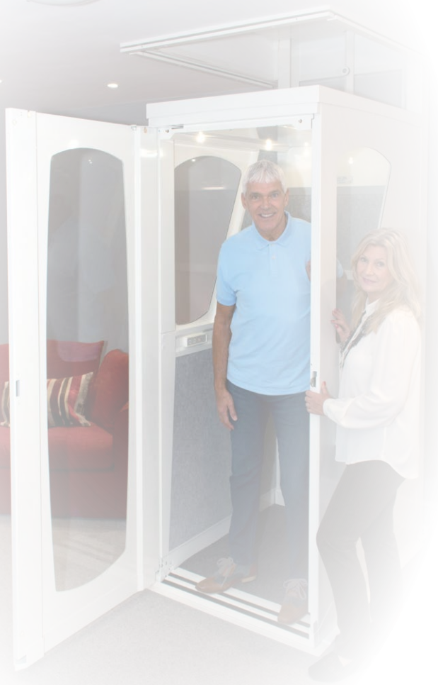
Harmony FE Home Lift

If you haven't previously considered a home lift, speak directly to the manufacturer and join the many customers who are experiencing the convenience and reliability of a Terry Lift. Call 01565 752 800 to ask any question, or to arrange a consultation.