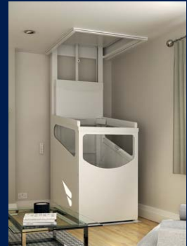
Harmony Home Lift