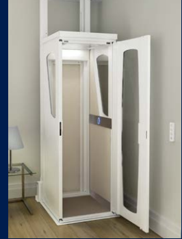
Harmony Fully Enclosed Homelift